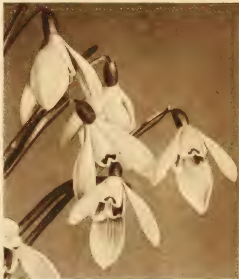
HENDERSON'S SINGLE SNOWDROPS

Elwes' Giant Snowdrop. One of the finest of the genus, at least three times the size of the ordinary single Snowdrop; flowers slightly marked with green spots; fine for cutting. 45c. per doz.; $3.25 per 100, postpaid.